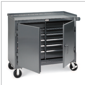
Heavy-Duty Mobile Tool Cart