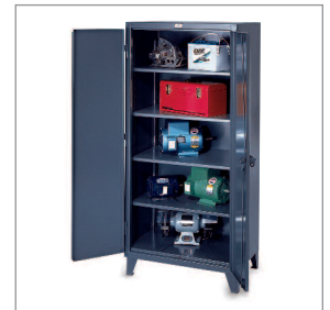
Ultra-Capacity Lifetime Cabinet

CALL NOW! 920.644.2332 FOR SPECIAL LOW PRICES